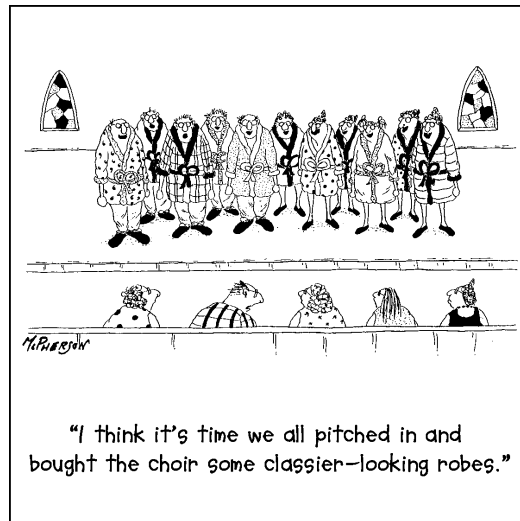
"I think it's time we all pitched in and bought the choir some classier-looking robes."

Answer: (See 3:16 ff, NRSV, of the book with the prophet's name.)